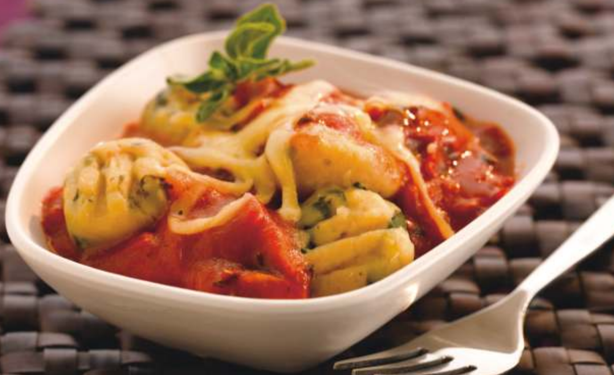
Spinach Gnocchi with Marinara Sauce